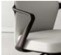
Aluminum Arm painted or polished optional leather wrap

Black casters will always come with painted bases; Chrome casters will always come with polished bases.