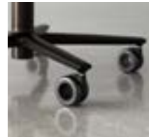
Hubless Casters black or chrome hard or soft