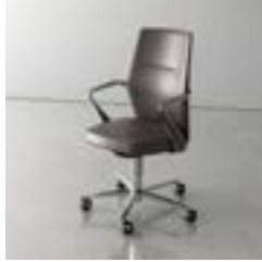
FESE02AA55 conference swivel aluminum arm

FERRA is an executive conference chair that merges timeless design with precision craftsmanship. Designed to deliver refined beauty and elevated comfort to the modern meeting space.