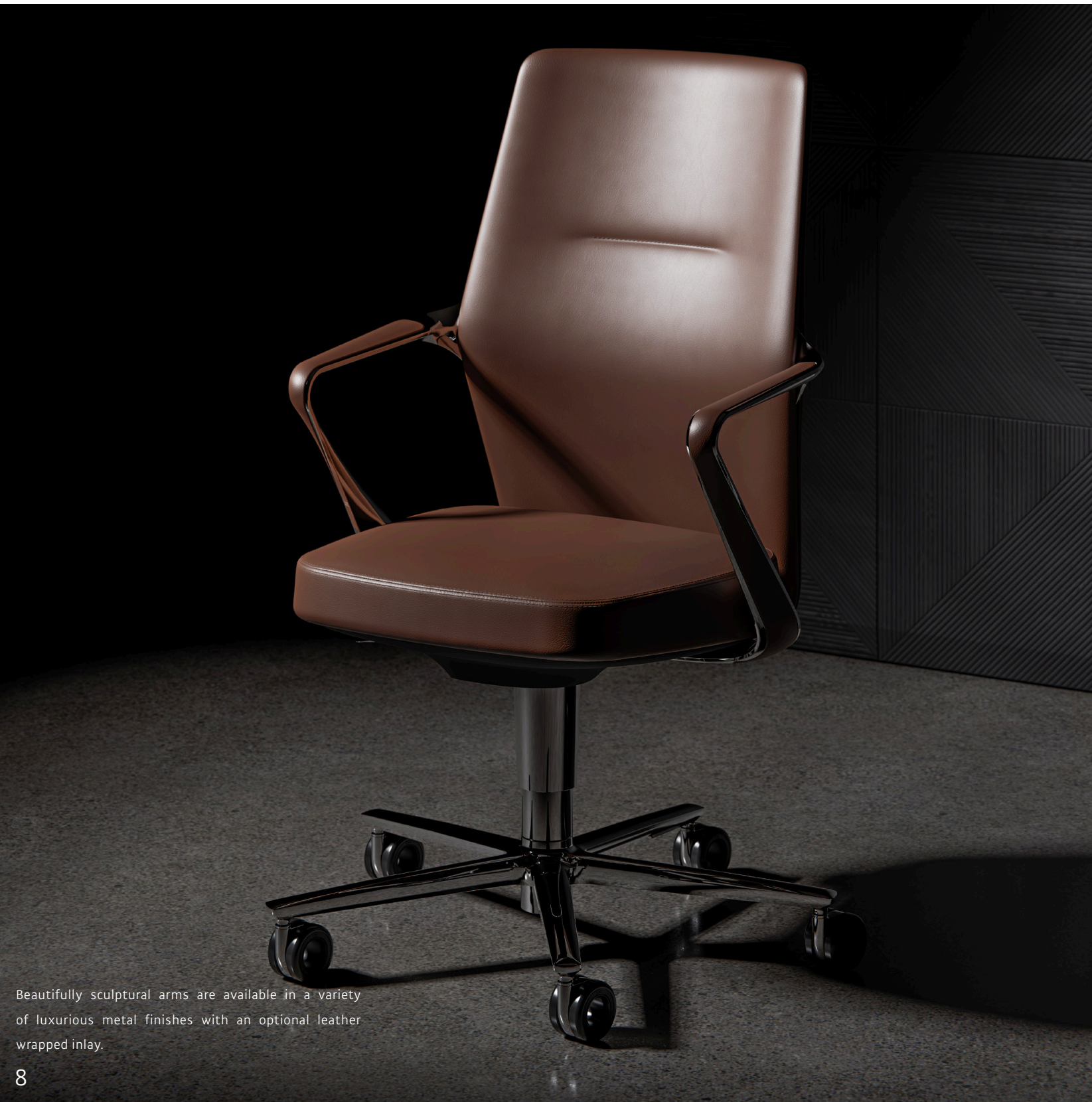
Beautifully sculptural arms are available in a variety of luxurious metal finishes with an optional leather wrapped inlay.